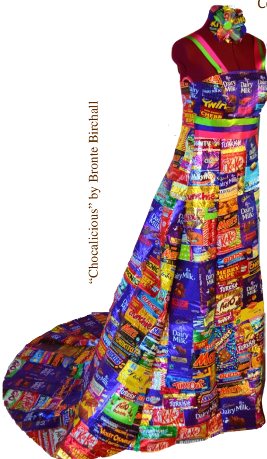
“Chocalicious” by Bronte Birchall