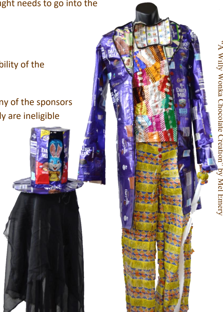
“A Willy Wonka Chocolate Creation” by Mel Emery